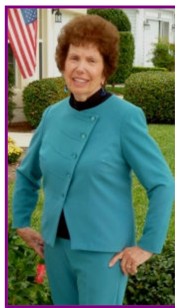
Tab Front Jacket

Every time Livingsoft releases a seasonal pattern collection, support is added for some new style or fashion trend that has proven popular that season. These new patterns often provide the basis for major new design enhancements that get incorporated into all patterns in the Dress Shop catalog. At least one of the new patterns developed for The Winter 2011 Collection has already made that leap - with this jacket. If you look under "Outerwear - Coats and Jackets", you should see the new "Cape" category items with the usual variety of collars, necklines, and collar options. Be sure to check the "Options - Shaping and Finish" dialog for armhole and finishing options.